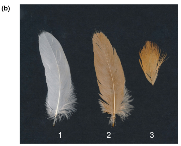
Figure 1. (a) Effect of stain treatments with mud rich in iron oxides (orange symbols) or water (open symbols) on the saturation of White Stork feathers throughout the experiment. Colour measurements were performed before the experiment started (pre-staining) and twice after staining treatment before applying the abrasion treatment and at the very end of it. Colour saturation values of naturally stained ventral feathers from wild Bearded Vultures are also displayed (grey symbols) for comparison with experimental feathers. Squares indicate means \pm sd. Note that in the pre-staining values, mud-treated feathers are not visible because they are overlaid by control dots. Similarly, sd bars are not visible in that sampling point because they are too small. (b) Illustrative image of control (1) and stained (2) White Stork feathers, together with a naturally pigmented Bearded Vulture belly feather tip (3) to allow comparison of how our treatment matched the natural cosmetic coloration achieved by this species.

In this experiment we used White Stork feathers under the assumption that their resistance to wear – and the effect of iron oxides on this – would be comparable